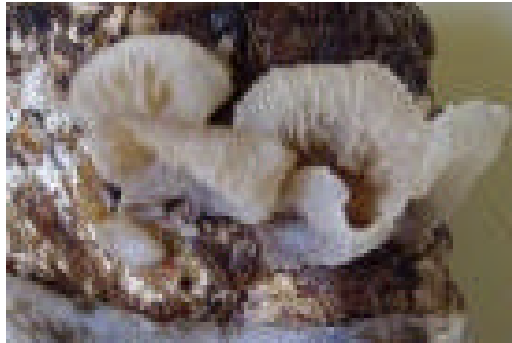
Fig. 2: High quality wood ears fruiting on maizecobs supplemented with wheat bran

quality ranging from a score of 2-4 (Table 3). The appearance of the mushrooms was excellent, with well-formed large caps and conspicuous stems (Fig. 2). Grass straw gave the lowest quality mushrooms followed by sugar baggasse. Wheat straw and wheat bran combination also gave good quality fruit bodies that ranged from 2-3 (Table 3). Supplemented wheat straw and sugarcane bagasse produced fruit bodies of average quality since their characters were intermediary in terms of shape, size and texture. The lowest quality fruit bodies were obtained from grass straw especially when supplemented with rice bran (Table 3).