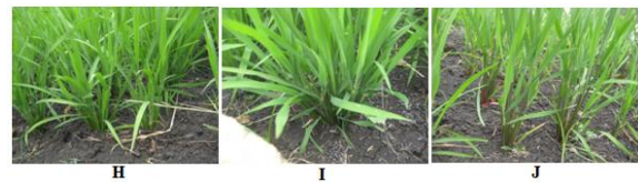
Fig. 1. Anthocyanin in F 1 and parent plants. Fig A-C represent cross between V1PGMS, V2TGMS and V3PGMS and Basmati370 while Fig. D-F represent cross between V1PGMS, V3PGMS and V2TGMS and Basmati217. Fig G represents Basmati370 and 217 while H-J represents V1PGMS, V2TGMS and V3PGMS in that order.