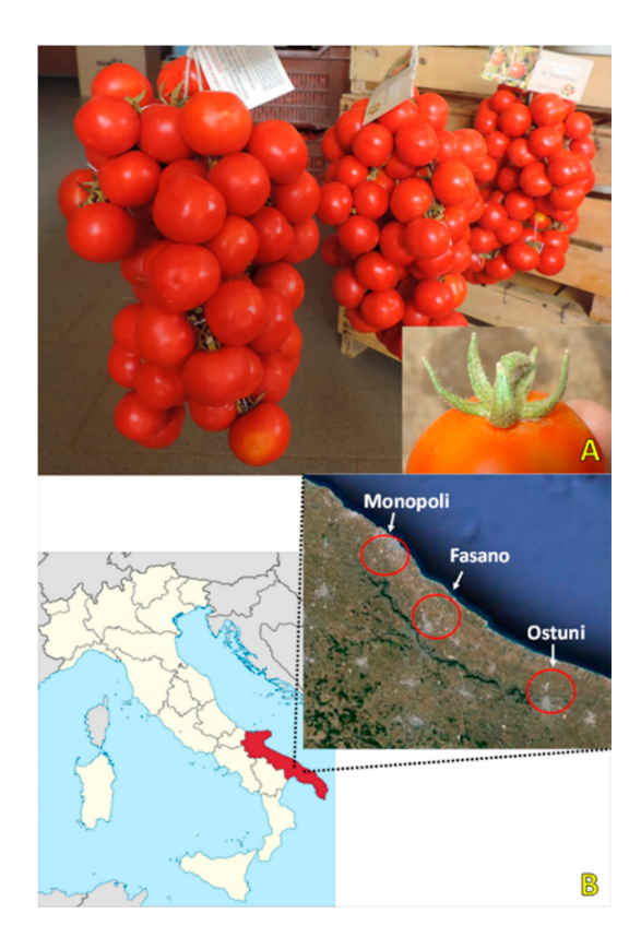
Figure 1. Bunches, so-called ramasole, of Regina tomato with a focus on the fruits calyx ( A ); map of Italy with Puglia region (highlighted in red) and a focus of the three sites (within the circle) where the Regina tomato ecotypes were cultivated and collected ( B ).

Regina is the name of a tomato landrace grown in the coastal saline soils of the central Puglia. This landrace takes its Italian name, Regina (Italian for "Queen"), from its calyx (Figure 1A), which takes the shape of a crown as it grows. It is listed as an item in the 'List of Traditional Agri-Food Products' of the Italian Department for Agriculture, since its processing, preservation and ageing methods are consolidated in time, harmonious for all the region involved, according to traditional rules, for a period not less than 25 years. Moreover, this landrace is registered also as 'Slow Food presidium' by the Slow Food Foundation [7] that aims to protect authenticity and origin of Italian traditional food products by valorising a geographical area and stimulating market opportunities.