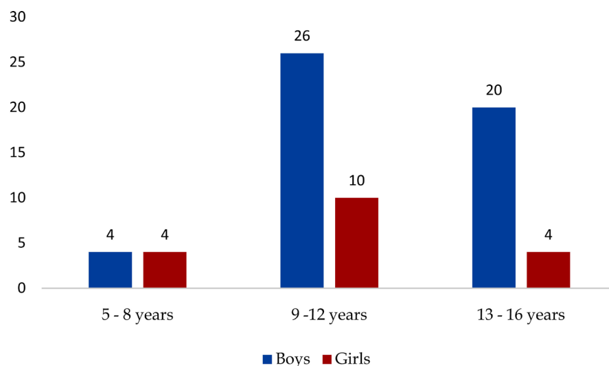
Figure 1. Distribution of patients by age and sex.

All patients underwent a short resuscitation with initial correction of haemodynamic troubles and analgesic treatment. A blood check-up including blood