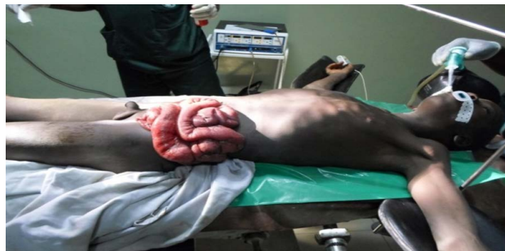
Figure 2. Evisceration in a 15-year-old adolescent.

All patients underwent surgery. The average surgery time was 54 minutes with extremes of 36 and 109 minutes. In the case of a non-penetrating abdominal wound, a parietal repair was performed under general anesthesia. This repair consisted in a trimming, a reconstruction of the muscular and aponeurotic plans and an excision-suture of the cutaneous edges of the wound. In the case of a penetrating wound, an enlarged wound allowed the systematic exploration of the abdominal cavity and the repair of lesions at the same time. Thus, in the case of perforation of the colon or small intestine, the surgical treatment included cleansing in the peritoneal cavity, followed by a suture. Drainage of the abdo-