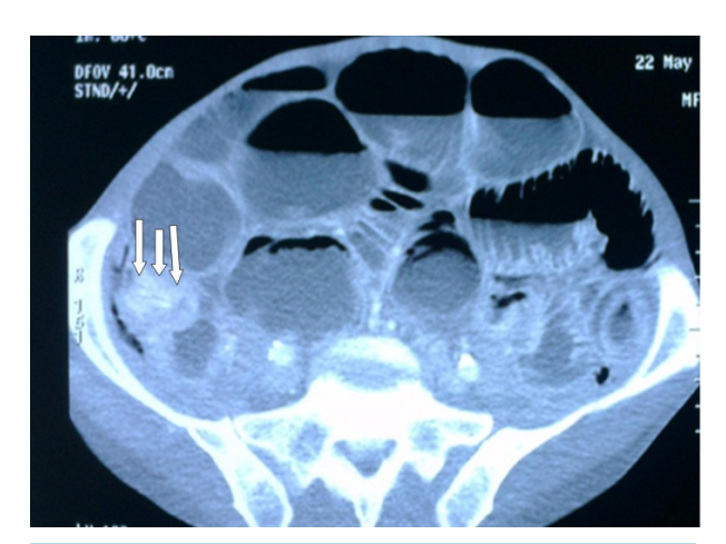
Figure 1. CT showing last ileal loop thickening with upstream small bowel distension.

Primitive malignant tumors of the appendix are rare and occur in 0.1% to 0.5% of appendectomy specimens [1] [2]. Their clinical symptoms are nonspecific; clinical presentation is dominated by an appendicular syndrome and/or acute appendicitis, abdominal pain or even fortuitously. The existence of such tumors, potentially serious is always to be considered and should lead to careful histopathological examination of all appendectomy specimens.